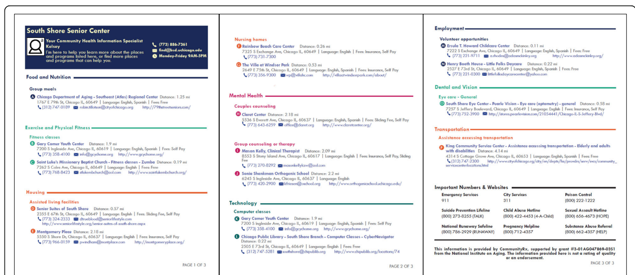
Fig. 1 Example HealtheRx for Alzheimer’s Disease and Related Dementias. a The version of the HealtheRx presented to caregivers in this study included a picture of the person in the role of the Community Health Information Specialist

Using a qualitative study design, in depth, semi-structured interviews were conducted with caregivers of community-residing persons with dementia. Caregivers were recruited