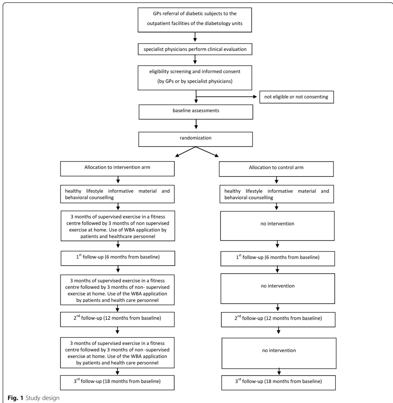
Fig. 1 Study design

non-clinically relevant information and all the exercise session report forms of the enrolled patients. GPs and specialist physicians will have access to both the clinical, non-clinical and exercise session data of all the patients they refer to the trial. They will therefore be able to monitor the patient’s adherence to the trial (according to the specific requirements of the study arm to which the patient has been assigned) and readily obtain the information needed to give the patient motivational feedback to improve compliance. The WBA will also allow investigators to store and access patients’ clinically and