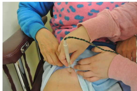
Fig. 1 The participants undertaking twitch interpolation test. The stimulating electrode was placed over the femoral nerve trunk underneath the femoral triangle

During training, the participants stood barefoot with knee joint flexed at 60° on the platform of a whole body vibration machine (Fitvibe excel, GymnaUniphy NV, Bilzen, Belgium) and hands holding onto the rail in front for support. A soft mat supplied by the Fitvibe manufacturer was placed on the vibration platform during all training sessions for protection. Participants were advised to keep their lifestyle and physical activity as usual during the study period.