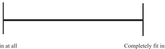
Fig. 3 Visual analogue scales

Do you feel that you fit in right now, a mark on the line to the left represents do not fit in at all, towards the right, completely fit in.