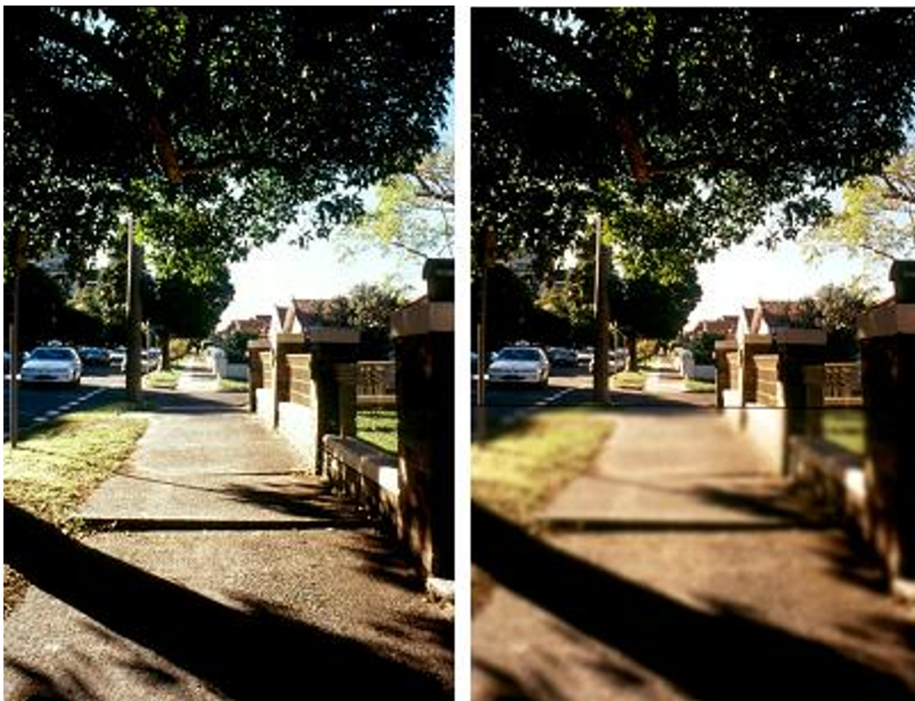
Figure 3 Simulated view of street scene as viewed through single-lens distance (panel A) and bifocal glasses (panel B). The footpath misalignment (a commonly reported environmental factor involved in outdoor falls) is clearly seen in panel A, but blurred in panel B.

vince older wearers of multifocal glasses that they are personally at risk of fall-related injuries and that the benefits of wearing single lens glasses outweighs the inconvenience of dealing with two pairs of glasses.