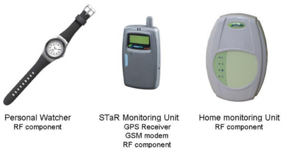
Figure 3 Elements of the location kit to be used in the project.

The GPS is programmed to obtain locations every 10 seconds when the tracked person is outside the home. The data collected in Israel and in Germany are sent by GPRS protocol to a control unit at the Hebrew University of Jerusalem where it is stored on the project's server. Family members of patients in the study group will be able to log onto the project web site to locate their family member in real time.