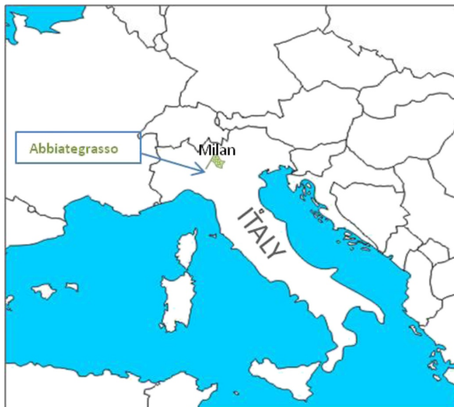
Figure 1 Map of the area of the “InveCe.Ab” study.

Following a single age quintile in a longitudinal study format allows us to minimize the confounding effect of age. The study is being conducted in a specific geographic area; hence, the recruited cohort is homogeneous with