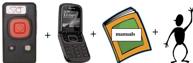
Figure 1 “PPAP” – transmitter, cell phone, manuals and support person.

All subsequent data collection occasions followed a specific pattern (Figure 2). First a joint informal conversation with the person with dementia and his/her spouse took place, where the couple summarized what had happened in their daily life, in relation to use of the PPAP, since the previous data collection occasion (Part 1). Then the person with dementia went for an outdoor walk, during which he/she was encouraged and instructed to walk as he/she normally did when alone. During this walk, an informal conversation was conducted with the person with dementia