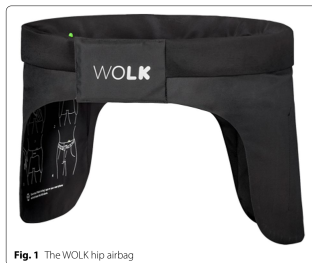
Fig. 1 The WOLK hip airbag

This retrospective study is a before- after comparison of the introduction of the WOLK hip airbag in 11 residential care homes belonging to one long-term care organization in The Netherlands. Figure 2 shows the study design and study periods. In the first period (control period), the WOLK hip airbag was not yet